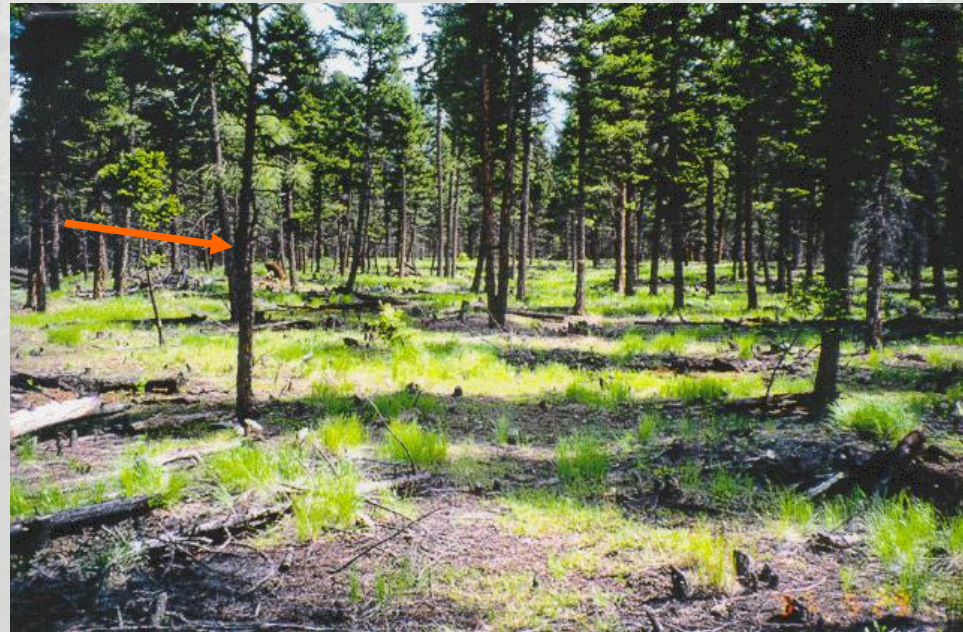
3 Years After